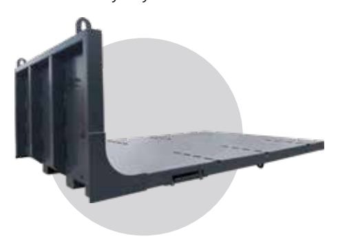
Light Duty Flat Bed