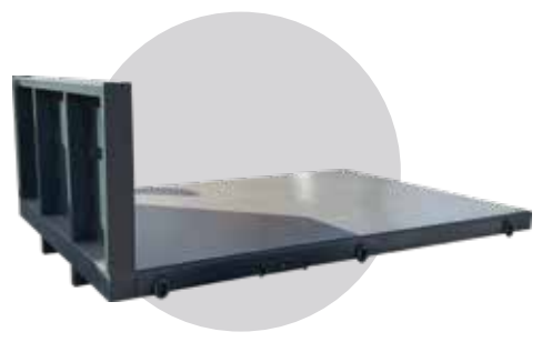
Heavy Duty Flat Bed

The flat bed is made from A36 steel with 5/16 inch thickness for the sides, floor and head-board and has three heavy duty grommets on either side for securing the load (heavy duty only), a tuckable step ladder on either side and hydraulic cylinders for load dumping.