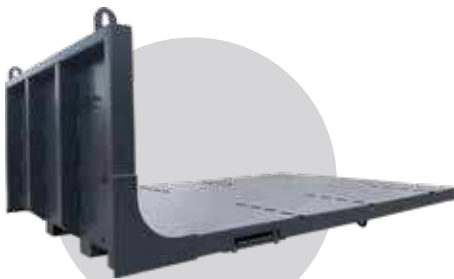
Light Duty Flat Bed