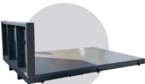
Heavy Duty Flat Bed

The flat bed is made from A36 steel with 5/16 inch thickness for the sides, floor and head-board and has three heavy duty grommets on either side for securing the load (heavy duty only), a tuckable step ladder on either side and hydraulic cylinders for load dumping.