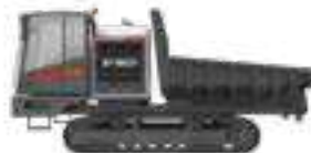
Rock Dump Crawlers